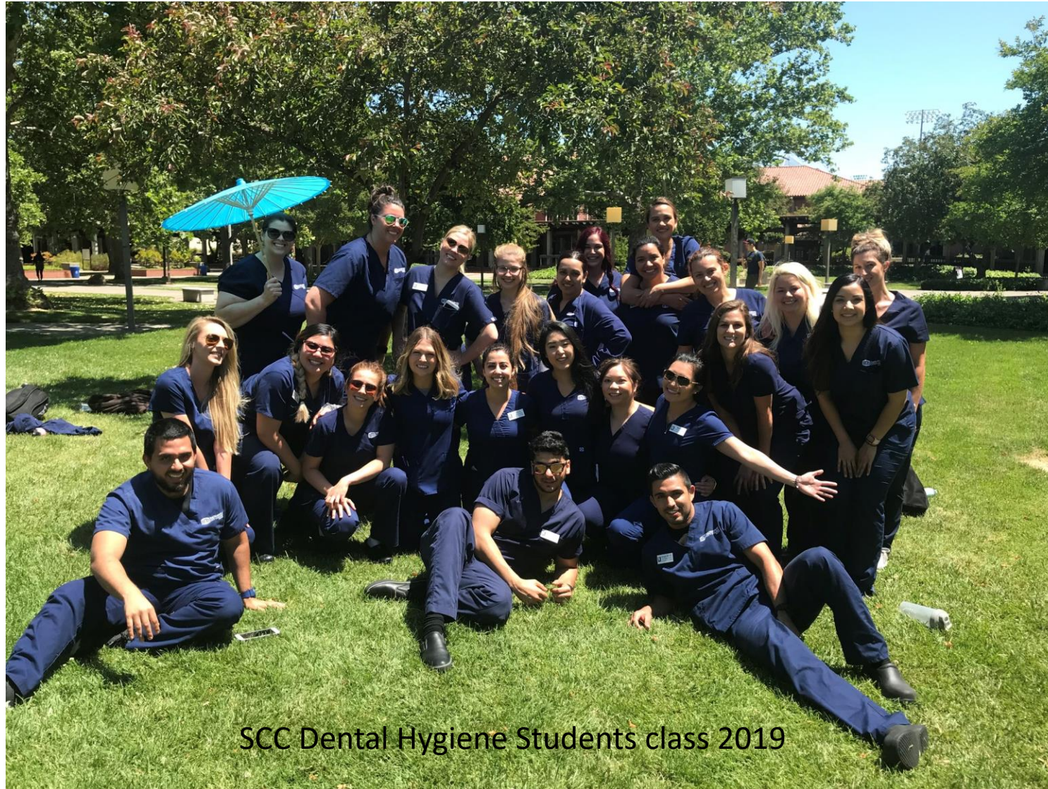
SCC Dental Hygiene Students class 2019